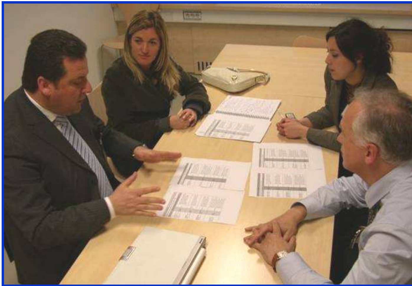
WORKING GROUP DISCUSSION

SMEs internationalization Seminar 2 - 4 April 2008 Sezana Slovenia