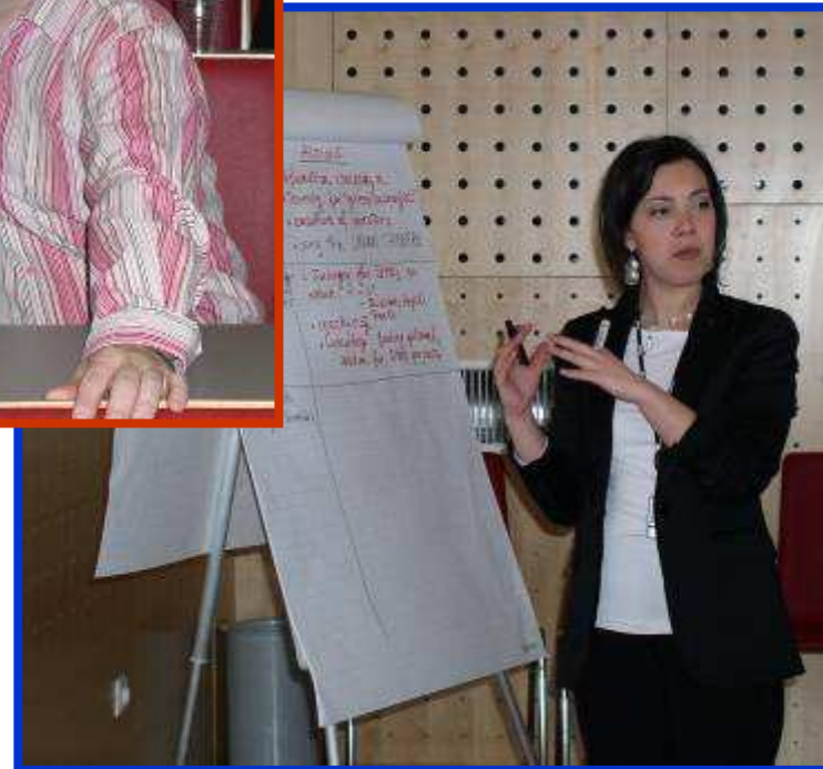
WORKING GROUP DISCUSSION