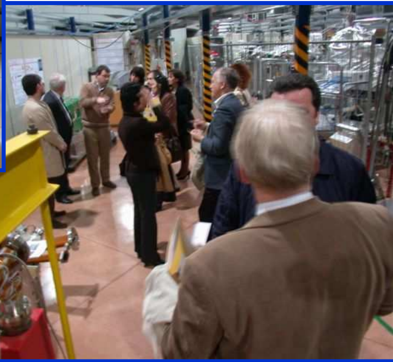
Visiting Business Innovation Center